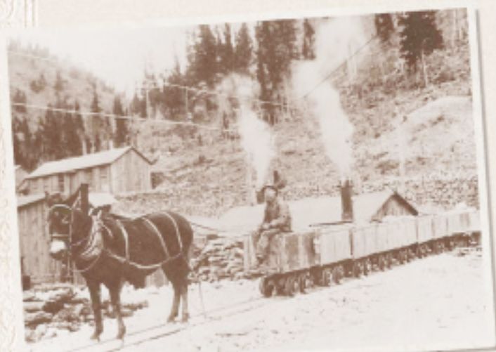
1917. Ore train at the Rawley 12 Mine.

and see old mines, historical buildings, and remnants of old time mining equipment. Along the way, you can also view present-day environmental restoration projects and beautiful vistas overlooking the San Luis Valley. Keep a lookout for elk, bighorn sheep, sage grouse, and mule deer. Enjoy your travels!