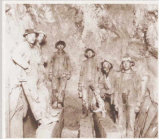
At the top of the main raise in the Rawley 12 mine, 1917.